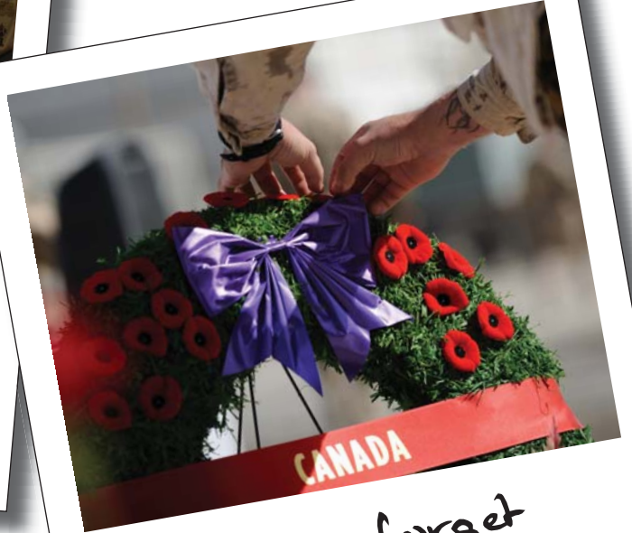
Lest we forget