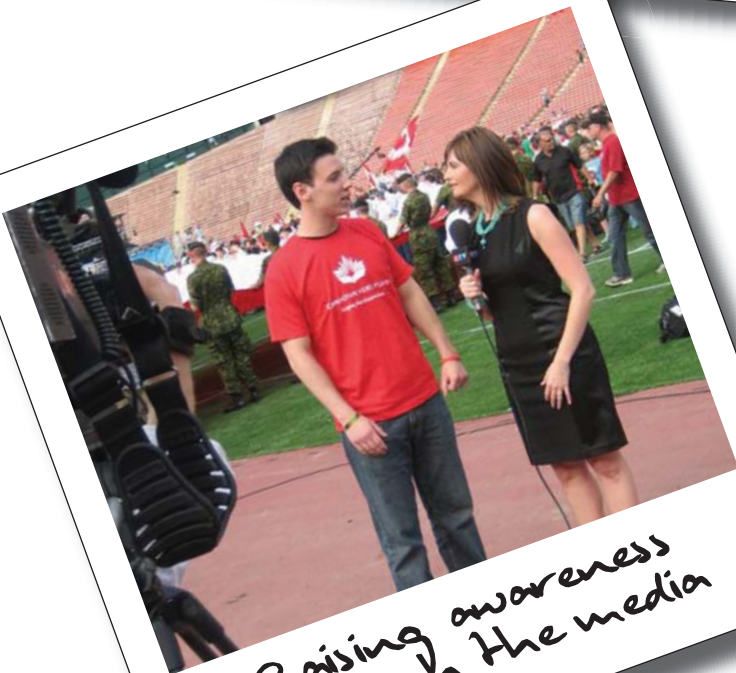
Raising awareness Through the media