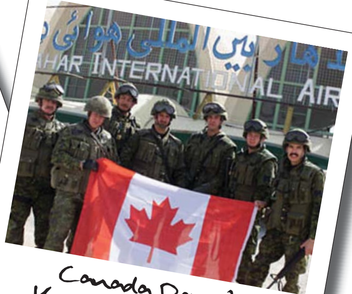
Canada Day at Kandahar Airport