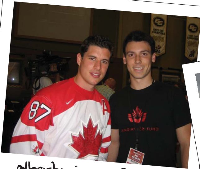
Alberta June 28 2010 Olympic Hockey Team

Michael Ignatieff, former M.P. and Leader of the Liberal Party of Canada