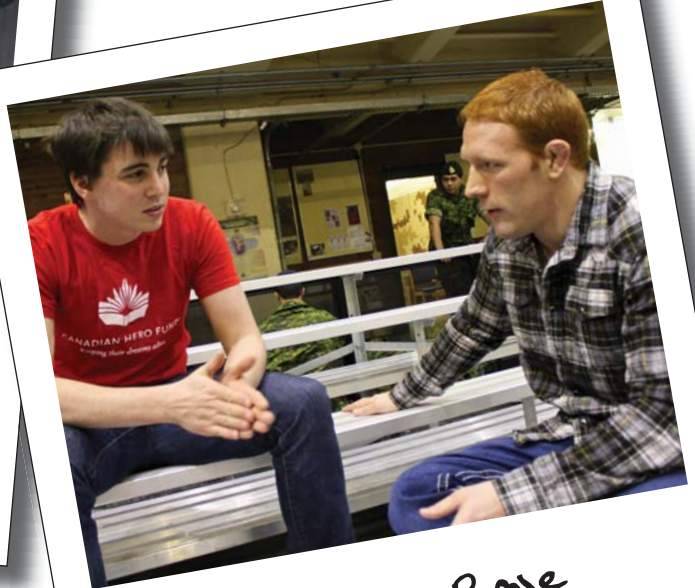
Visits on Base